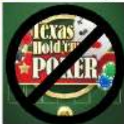
TEXAS HOLD'EM POKER

WEDNESDAY NIGHTS 4:00PM UNTIL ? 12 WEEKS